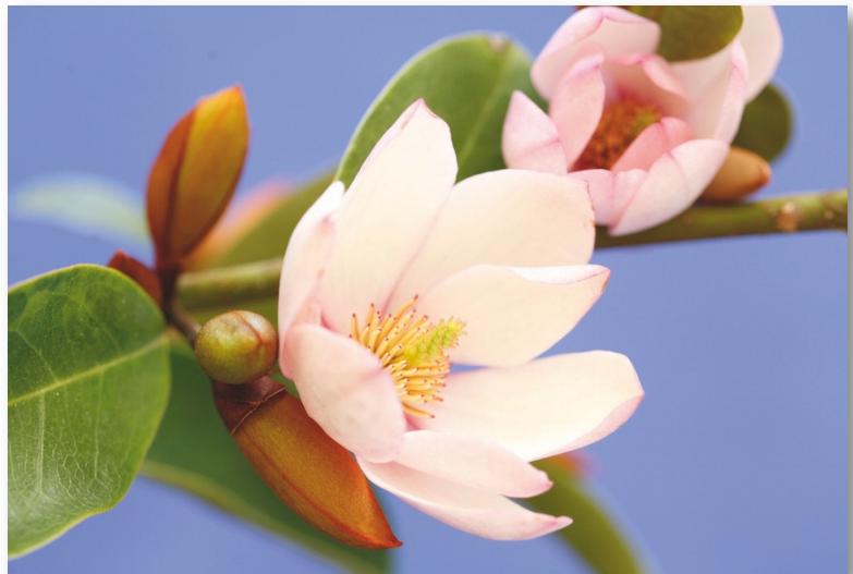
Fragrant Fairy Magnolia 'Blush' combines the soft pink of Pantone's Pale Dogwood and the rich brown of Hazelnut.

However you choose to use the Pantone Color Institute's Top 10 picks for spring 2017, just spend a little time outdoors and you're sure to find plenty of inspiration!