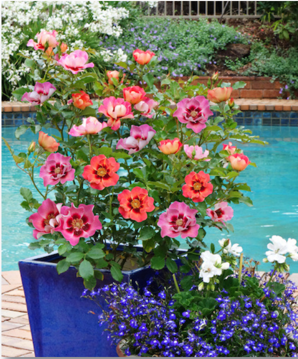
Sweet Spot 'Calypso' offers a range of ever-changing colors! This Decorator Rose™ is ideal for incorporating many of this year's colors into your décor.

Looking for something a little more subtle? New Thunder Storm™ agapanthus' variegated soft Kale green and white foliage serve as the perfect complementary background to its intense Lapis Blue blossoms. Planted along a walkway or as a border plant, easy-care Thunder Storm ( below ) adds texture and color to any setting.