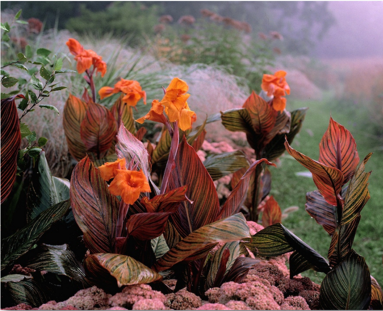
Here Tropicanna is planted with sedum Autumn Joy and a soft pink Muhly grass, incorporating many of this year's Pantone color picks into a single landscape.

And finally, Pantone describes its Pale Dogwood as “a quiet and peaceful pink shade that engenders an aura of innocence and purity. The unobtrusive Pale Dogwood is a subtle pink whose soft touch infuses a healthy glow.” If you'd like to infuse your senses with not only this lovely calming color each spring, but a also soft gentle fragrance, plant a Fairy Magnolia near a porch or open window. Growing to only 5-7 feet wide and 9-12 feet high, this sweet little shrub has lovely Hazelnut buds that open to a fragrant soft pink petals each spring. It's ideal as a specimen plant in small gardens and containers, espaliered or as a hedge in larger landscapes. Regardless of how you use it, this free-flowering beauty is sure to add a peaceful touch to any space.