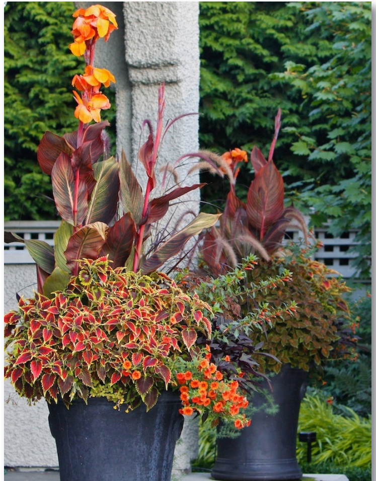
With its colorful foliage and bright blossoms, Tropicanna canna works well on its own but can also be mixed with a variety of other Pantone 2017 color picks, including Primrose Yellow, Flame and Kale.

According to the folks at Pantone, "Flame, is gregarious and fun loving. Flamboyant and vivacious, this wonderfully theatrical shade adds fiery heat to the spring 2017 palette." If you enjoy bright colors, Tropicanna canna certainly fits the bill with its multi-stripped orange and green foliage and bright red-orange blossoms. Whether planted in rooftop garden containers or simple garden beds, Tropicanna brings an exotic touch to any space. Interplant Tropicanna with bright red-orange sun-tolerant Bonfire® begonia and you'll really have a sizzling combination – one that brings in at least half of this year's Pantone colors!